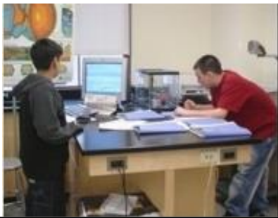
Students using the educational seismograph.

If you are unable to be a program sponsor, a donation in any amount would be appreciated!